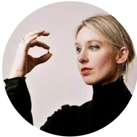
Founded in 2003 by Elizabeth Holmes